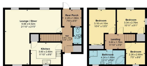
10, Alder Grove, Lytham St Annes, FY8 4LA

John Ardern & Company for themselves and their clients declare that they have exercised all due diligence in the preparation of these details but can give no guarantee as to their veracity or correctness. Any electrical or other appliances included have not been tested, neither have drains, heating, plumbing and electrical installations. All purchasers are recommended to carry out their own investigations before contract. Details Prepared November 2024